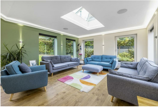
Lounge 19'7" x 14'11" (5.99m x 4.56m)