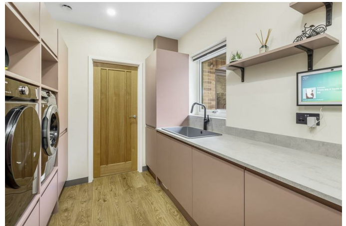
Utility Room 7'9" x 13'4" (2.38m x 4.07m)

UPVC windows to rear. Cupboard housing data cabling. Sink unit with mixer tap. Eye level washing machine and tumble dryer. Vertical radiator. Ducted air conditioning. Fully fitted furniture with matching wall and base units with work surfaces over. Integrated dishwasher.