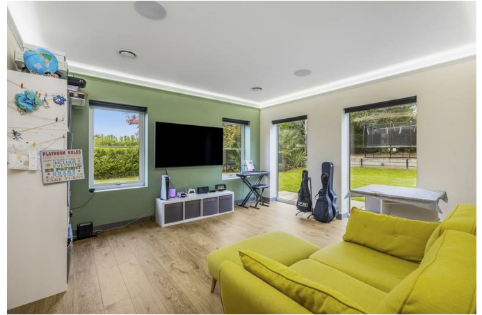
Play Room 14'0" x 13'0" (4.27m x 3.97m)

UPVC windows to rear and side. Wood effect flooring with under floor heating. Ducted air conditioning. LED uplight strips. Ceiling mounted speakers connected to home automation. Electric automated blinds. TV point with home automation unit.